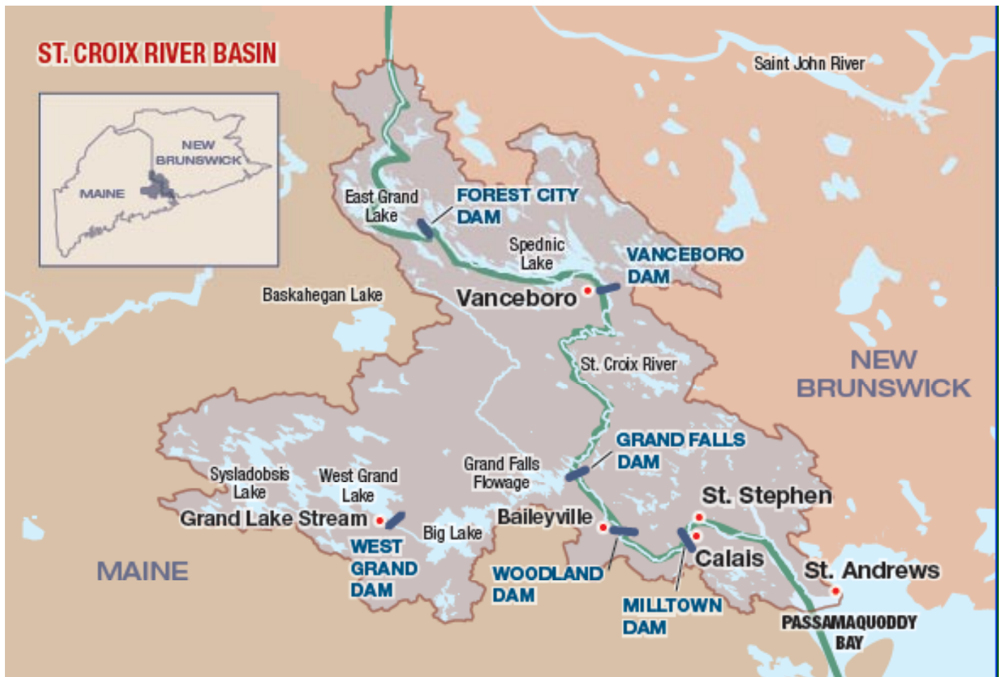
Figure 1. Map of the St. Croix watershed, with selected towns, dams, and lakes in Maine and New Brunswick identified.

By the early 1980's improved fish passage and water quality in the St. Croix system resulted in an increasing alewife spawning population. This was perceived to have contributed to declining numbers of juvenile bass and poor quality smallmouth bass angling in Spednic Lake. A number of management changes were made simultaneously to address this decline, including blocking alewives from Spednic Lake beginning in 1987, which made it impossible to determine the relative impact of each action. In 1991, American and Canadian fisheries agencies began an alewife production assessment in the lower St. Croix watershed by temporarily blocking alewife passage at Grand Falls Dam. The temporary blockage was to end in 1995, however, the Maine Legislature prohibited alewife passage at the Woodland and Grand Falls fishways (12 MRSA§6134, 1995). This eliminated alewife access to over 98% of the species' projected St. Croix spawning habitat (Anonymous 1993). The stock declined from 2.6 million returning alewives in 1987 to only 900 in 2002 (St. Croix International Waterway Commission 2009). When efforts to change Maine's 1995 St. Croix alewife blockage law failed in 2001, Department of Fisheries and Oceans, Canada (DFO) began trucking a portion of the river's alewife run around the Woodland Dam.