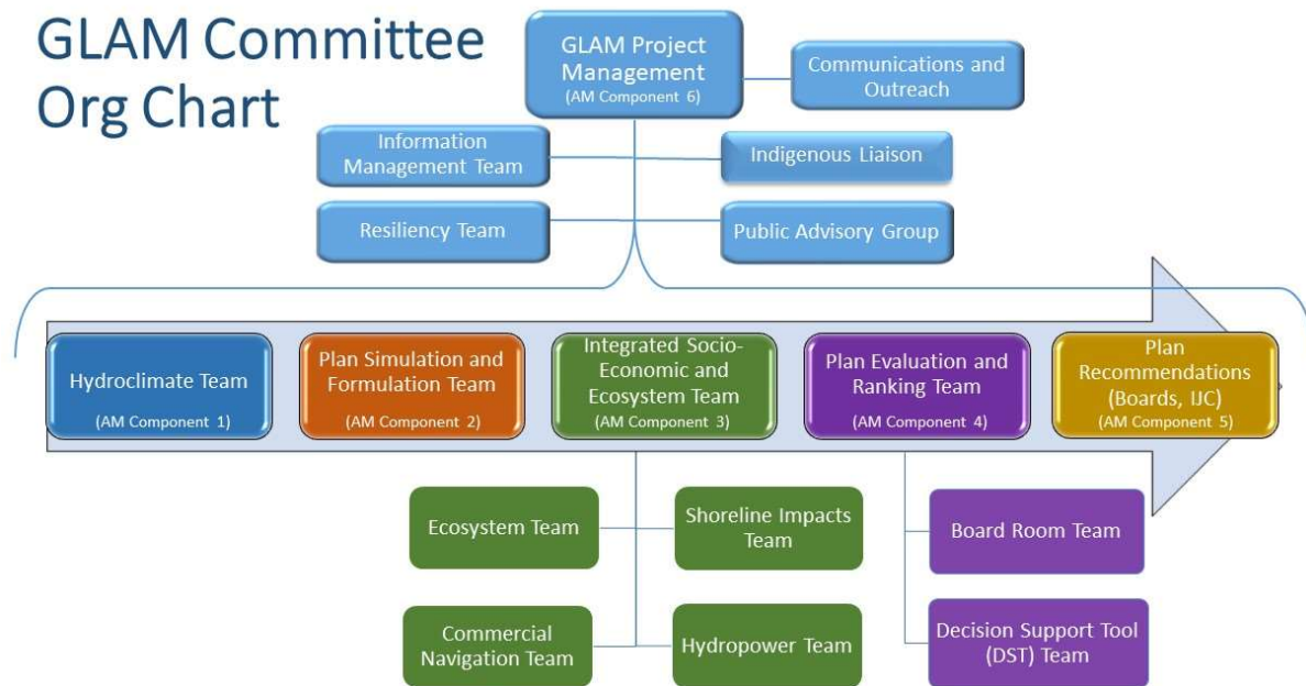
Figure 3: GLAM Committee team structure to support Phase 2