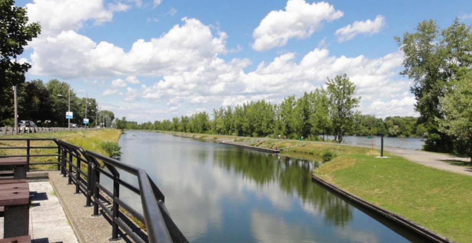
The Chambly Canal alongside the Richelieu River

as they involved the damming of the river with significant effect on its flow and the surrounding environment. Thus, the Study Board determined that no further resources should be committed to assessing these options.